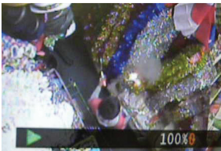
Child starts fire using BBQ lighter.

These photographs from security camera film show what happened in Auckland: