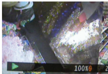
35 seconds later a fire is burning fiercely.